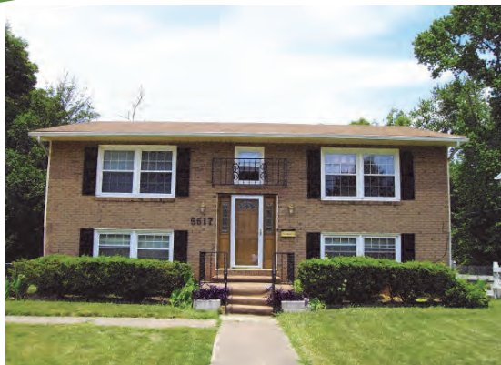
Oxford House Ilford — Charlotte, NC

Oxford House™ is a concept and system of operation that enables recovering alcoholics and drug addicts to live together in a self-help environment, which greatly increases the odds of sobriety without relapse. As of August 2013 1,622 Oxford Houses have been established in 383 cities in 44 states in the United States – a big increase from the 18 local houses that existed when expansion began in 1989. More than 250,000 individuals have lived in an Oxford House since the first one started in 1975.