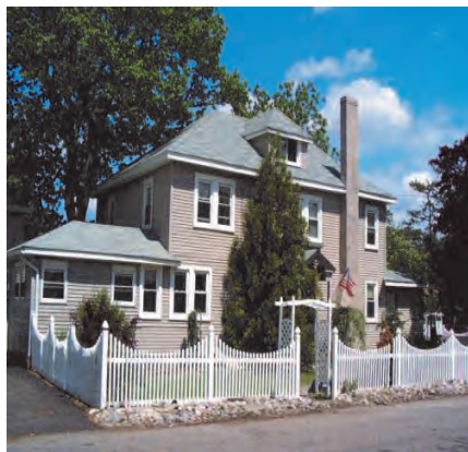
Oxford House Lookout Beachwood, NJ